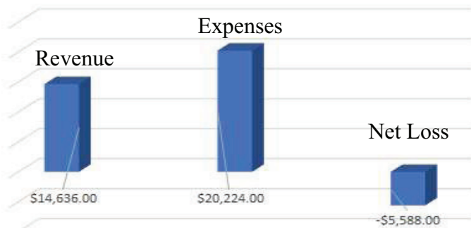
St John - Financials for July 2025

Expenses include a $8,250 installment for insurance.